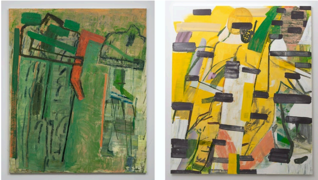
Left: Amy Sillman, Split 4 , 2020. Right: Split 3 , 2020. Acrylic and oil on linen, 72 x 60 inches each. © Amy Sillman. Courtesy the artist and Gladstone Gallery, New York and Brussels.

Sillman is an inventive abstractionist. She melds formal properties so skillfully you're never sure whether she's more interested in color, line, or shape, the subject of a memorable exhibition she curated from the collection of the Museum of Modern Art when its new building opened last year. She often includes fragments of bodies like legs, torsos, and heads to her otherwise nonfigurative canvases. They provide scale and add an emotional wallop. As for her palette, she favors lavenders and greens—colors other artists avoid.