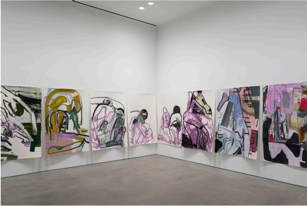
Installation view: Amy Sillman: Twice Removed, Gladstone Gallery, New York, 2020.