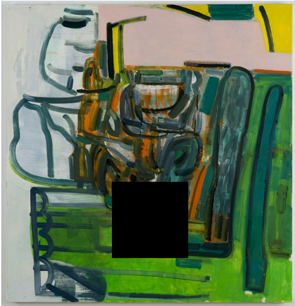
Amy Sillman, Untitled (green), 2020. Acrylic, ink, and oil on canvas, 51 x 49 inches.

Every so often, both established and emergent painters, sculptors, and photographers mount solo shows that stop you in your tracks. Some of these exhibitions even acquire legendary status. Need I mention Barnett Newman's abstractions at French & Company, Philip Guston's Klan imagery at Marlborough, or Susan Rothenberg's horses at Willard? This fall, which already boasts a rare blue moon, Amy Sillman is holding her own landmark exhibition at Gladstone. For starters, it's multifaceted. Four types of works are on view: paintings Sillman planned to include in a show that was postponed last May due to COVID-19; canvases she subsequently executed during the lockdown; 60 by 40 inch unframed drawings that are displayed in an alcove-like space as if they were a frieze; and a generous sampling of flower studies she made while sequestered without a studio on the North Shore of Long Island.